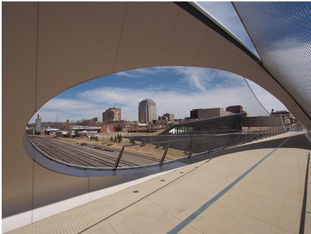
“View from the Bridge” by Art Porter